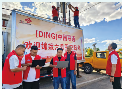
Inner Mongolia Unicom provided communication assurance services for the return of the Chang'e-6 probe

Shanghai Unicom collaborates with the Shanghai Emergency Bureau and the Shanghai Public Security Bureau Police Aviation Team to develop a 4/5G adaptive airborne base station system based on China Unicom's dedicated satellite frequency, which is mounted on rescue helicopters to provide stable and efficient communication support for emergency rescue operations.