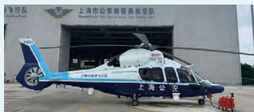
Shanghai Police Aviation Team's EC-155 helicopter platform equipped with China Unicom emergency communication equipment

Shanghai Unicom collaborates with the Shanghai Emergency Bureau and the Shanghai Public Security Bureau Police Aviation Team to develop a 4/5G adaptive airborne base station system based on China Unicom's dedicated satellite frequency, which is mounted on rescue helicopters to provide stable and efficient communication support for emergency rescue operations.