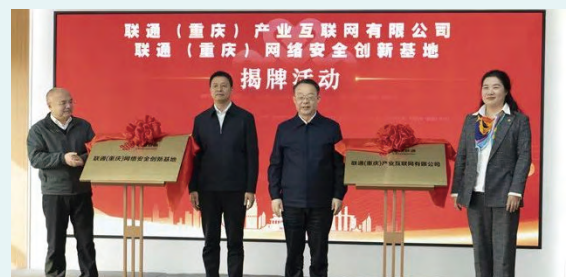
The unveiling of the Unicom (Chongqing) Network Security Innovation Base

Unicom (Chongqing) Cybersecurity Innovation Base was unveiled in Xiantao Data Valley, Yubei District. The base is equipped with three laboratories: information and communication technology innovation and adaptation laboratory, joint innovation laboratory for network security in production, education and research, and data security laboratory, aiming to enhance network security protection capabilities. At the unveiling ceremony, Chongqing Unicom, together with Chongqing University, Southwest University, QAX, and nearly 20 other entities, jointly established the “Unicom (Chongqing) Network Security Innovation Consortium”.