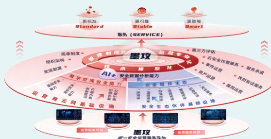
Mogong Unified Security Operation Service Platform

“Mogong” security operation service links with “Security Hub” to provide customers with one-stop purchase of security products and comprehensive systematic security operation services, continuously meeting customers' diverse and scenario-based operational needs in the face of new cyber security risks. The new model of “Mogong Platform + Industry Chain Components + Joint Operation Services” has already covered 70 ecosystem partner manufacturers and over 230 industry chain ecosystem security components.