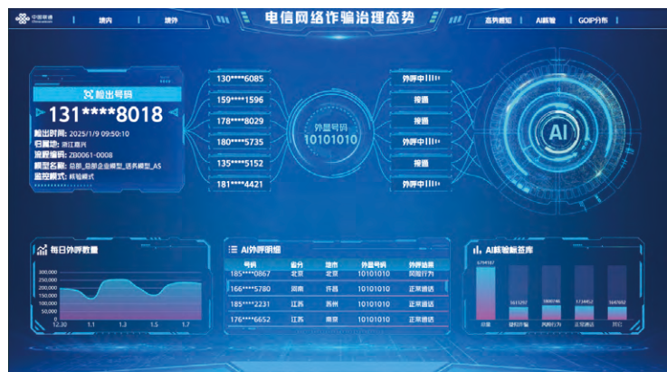
China Unicom AI Outbound Operations Dashboard