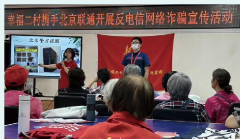
Beijing Unicom “517” Telecom Day Anti-Fraud Promotion Event On-Site

• Conducting comprehensive anti-fraud education for all. The Company launched a collection of anti-fraud publicity and education works with diverse types, comprehensive nodes, segmented audiences, and both internal and external considerations, among which the anti-fraud video column “Unpreventable” won the third prize in the Seventh Central Enterprises Excellent Story and the First AIGC Creative Communication Works.