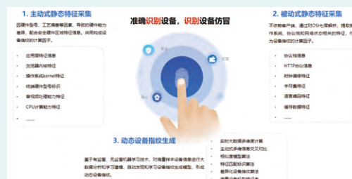
“Zero Trust Escort” Solution

Chongqing Unicom has timely deployed the “Zero Trust Escort” solution. The plan, centred around the philosophy of “never trust, always verify”, established a dynamic and continuous security protection system through technologies such as zero trust architecture, high-strength device fingerprinting, SPA pre-authentication, and security sandboxing, ensuring the security and privacy protection of customer information.