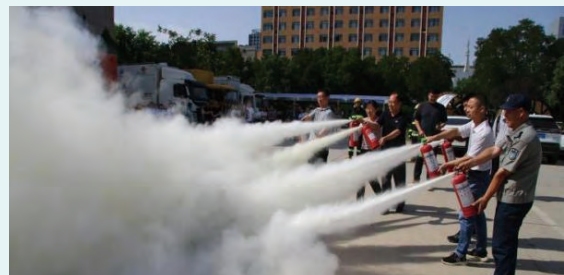
Ningxia Unicom emergency evacuation drill

Ningxia Unicom conducted maintenance inspections and rectification of potential hazards focusing on waterproofing, lightning protection grounding, and equipment operation safety at key node machine rooms. During the national "Safety Production Month", 18 safety production education and emergency evacuation drills were conducted, with 1,036 participants.