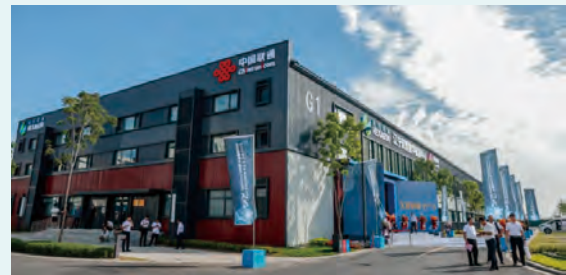
Digital Liaoning Empowerment Centre (Intelligent Computing Power Centre)

“Digital Liaoning Empowerment Centre (Intelligent Computing Power Centre)” is the digital empowerment service platform jointly constructed by the Shenfu Reform and Innovation Demonstration Zone, Liaoning Unicom, and Hexagon. It is based on a new data centre security assurance system of “monitoring and early warning, security protection, emergency response, and comprehensive management”. It provides integrated software and hardware defence services with network security as the baseline, effectively countering cyber attacks and threats.