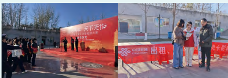
Conduct anti-fraud publicity

Shanxi Jinzhong Unicom collaborates with the police to conduct anti-fraud publicity. By improving the local anti-fraud data model, it promptly handles high-risk users, further reducing users' fraud-related risks.