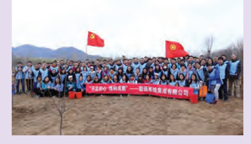
The "remembering original aspiration and creating forested landscape" themed tree planting activity of China Unicom System Integration