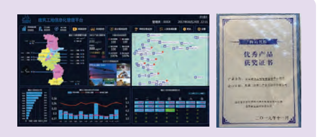
Data displayed on mobile Apps

"outstanding cloud and digital product" by Jiangsu Economic and Information Technology Commission.