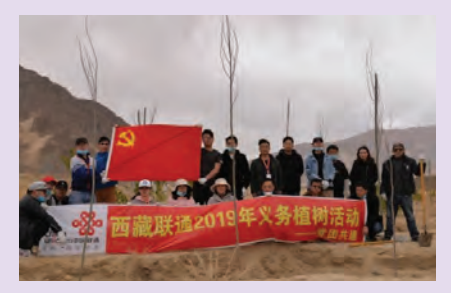
The "building a beautiful Tibet" tree planting activity of China Unicom Tibet branch