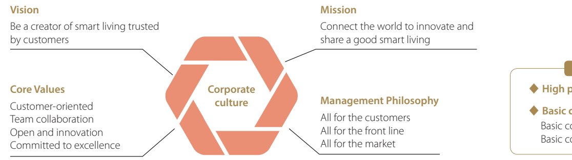
China Unicom Corporate Culture System

In 2018, China Unicom continued to engage in a corporate culture development exercise with intensive effort to drive the building of corporate culture as a means to strengthen the enterprise. The China Unicom corporate culture system comprises a core value system, including the Company's vision, mission, core values and business management philosophy, as well as code of conduct formed by the "Prohibitions of Behaviours" and the Basic Codes of Conduct.