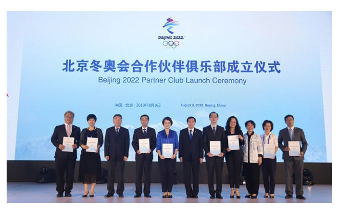
Beijing 2022 Partner Club Launch Ceremony

For 5G deployment, Beijing will be a key city for the 5G trial in network construction while exploring for new business models. Leveraging the mixed-ownership reform, step up to nurture and enhancing high-quality 5G innovative development will empower new energy. With the spirits of Winter Olympics, efforts are made on all fronts to turn "Smart Winter Olympics" into a new signature for the capital city.