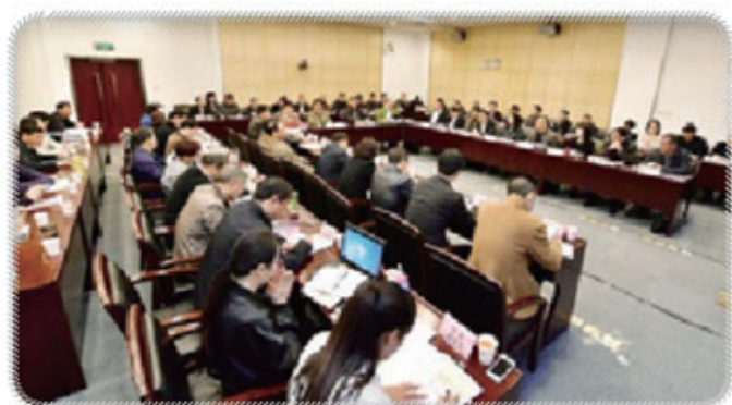
China Unicom’s anti-corruption risk control (Nanpian District) training held in Fujian.