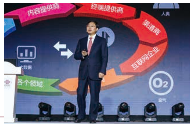
2016 China Unicom Partners Conference