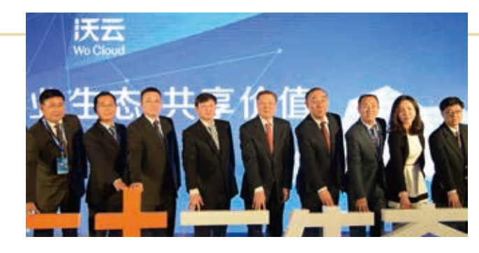
Inaugural Meeting of "China Unicom Wo Cloud + Cloud Ecology Alliance"

China Unicom initiated to establish the "China Unicom Wo Cloud + Cloud Ecology Alliance" which is participated in by over 30 industrial leaders such as global chip manufacturers, hardware manufacturers, database vendors, software application service providers and integration service providers. This industry alliance aims to gather the edges and resources of each part in the cloud computing industry chain, build a complete cloud computing industry ecosystem, and promote prosperous development of cloud computing ecosphere in China. Meanwhile, the Company has pushed forward the upgrade of standards, industrial applications and industrial services in cloud computing.