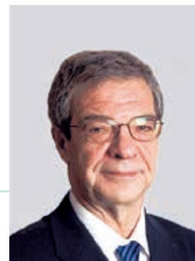
CESAREO ALIERTA IZUEL

Executive Director and Chief Financial Officer