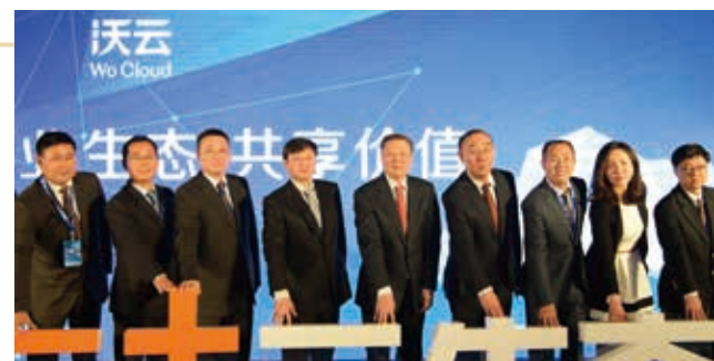
Inaugural Meeting of “China Unicom Wo Cloud + Cloud Ecology Alliance”

China Unicom initiated to establish the “China Unicom Wo Cloud + Cloud Ecology Alliance” which is participated in by over 30 industrial leaders such as global chip manufacturers, hardware manufacturers, database vendors, software application service providers and integration service providers. This industry alliance aims to gather the edges and resources of each part in the cloud computing industry chain, build a complete cloud computing industry ecosystem, and promote prosperous development of cloud computing ecosphere in China. Meanwhile, the Company has pushed forward the upgrade of standards, industrial applications and industrial services in cloud computing.